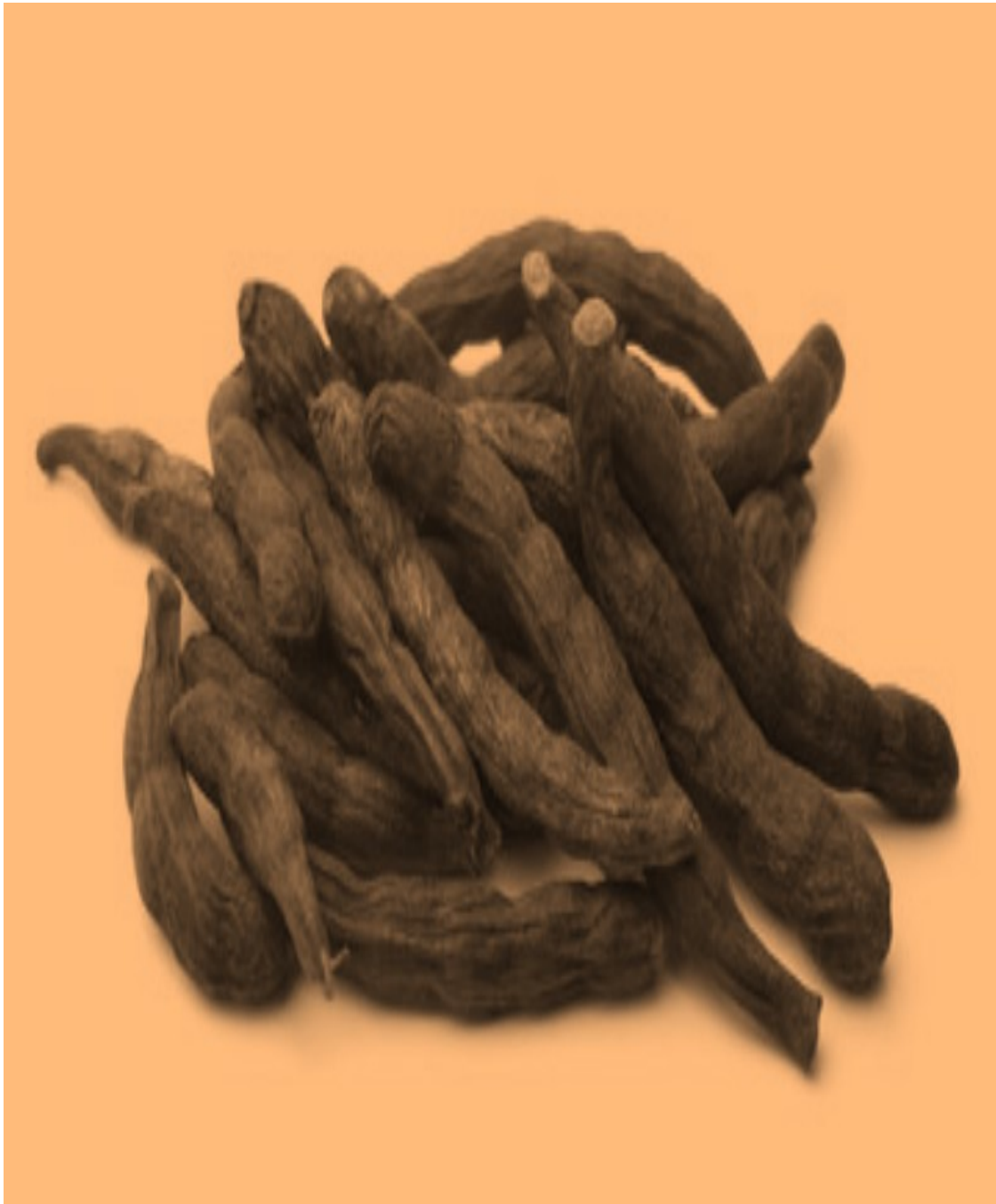
Fig 1: Xylopiya aethiopica Dried Fruits (Grains of Selim)